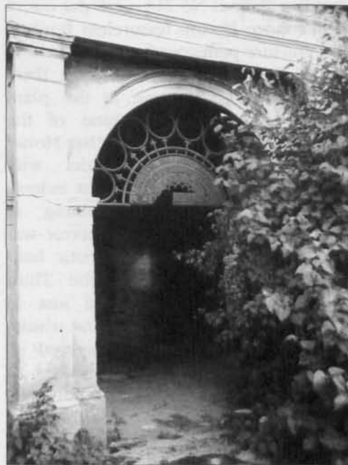
Entrance to Münsterberg Jewish cemetery

Schindler's List was filmed. In any event, Kasimierz, formerly the Jewish quarter until the Nazis forced the Jews into a ghetto on the other side of the river, is bubbling with Jewish-style restaurants, renovated synagogues converted to Jewish museums, hotels with Jewish or biblical names and even a (non-operational) mikvah . The oldest synagogue – the beau-