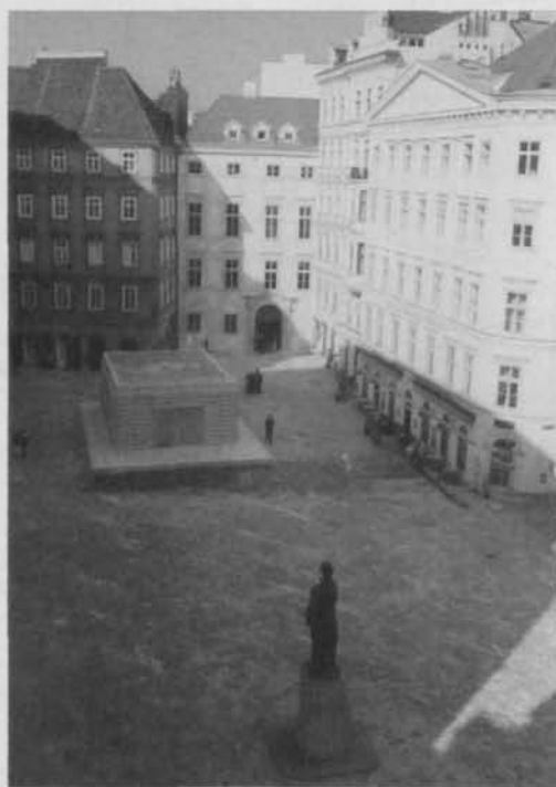
The Judenplatz, Vienna

Vienna is an arch-conservative city in matters of art as Mozart, Mahler, Klimt and others found out to their cost. Even so, a century ago the Sezession group of painters coined the slogan Der Zeit ihre Kunst (every age has an art appropriate to it) which one cannot quarrel with. The Romanesque harked back across the barbarian void to Roman civilisation. The Gothic age built heavenward-soaring structures which articulated Faith. The Renaissance shifted the focus from the linear to the circular – the circle being seen as the symbol of perfection. Futurism claimed to be the art form of the machine age. And what is the art appropriate to the Age of Genocide? Certainly nothing literal or figurative along the lines of Alfred Hrdlicka's 'Monument to the Victims of War and Fascism' at the Albertina in Vienna. Here the sculpture of the pavement-scrubbing Jew has been known to serve as a