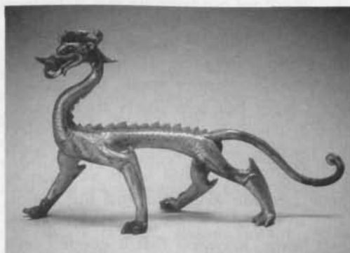
Dragon, Gilded Bronze, Tang Dynasty (618-906 AD).