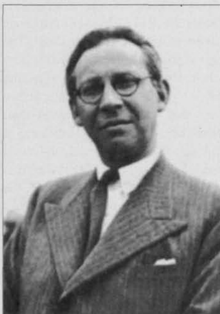
Sir Alexander Korda, Britain's only movie mogul

Vienna the following year (making two films), he began to earn the reputation of a cultural chameleon. Despite little money or work, he rapidly assimilated and presented the image of a wealthy film man. For Korda the ability to assimilate, as with many other refugees, was a strategic move, particularly in an image-conscious industry. He followed a similar path in Berlin in 1923, making five films there before emigrating to Hollywood in 1927.