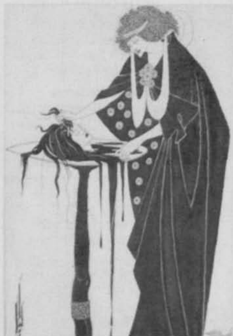
Aubrey Beardsley, 'The Dancer's Reward', for Salome , 1893