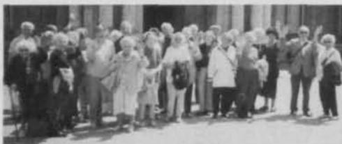
Great day at Waddesdon for North and South London

This proved to be an exceptionally interesting day. It was also not devoid of Jewish interest in that a copy of the Balfour Declaration was on display in one of the rooms. Apparently the British government of the time sent the original declaration to the Rothschilds rather than to an official Jewish communal organisation.