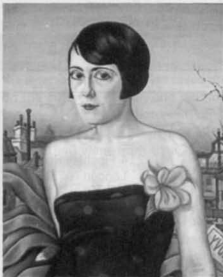
Maika 1929 by Christian Schad. Oil on canvas. Private Collection.

In his poem whose title inspired the exhibition, Ezra Pound described the faces he saw on the Paris Metro in 1913 as 'petals on a wet, black bough'. In fact, the only face that stands out for me is Christian Schad's somnolent flapper girl, a tight-lipped brunette with a red hibiscus flower.