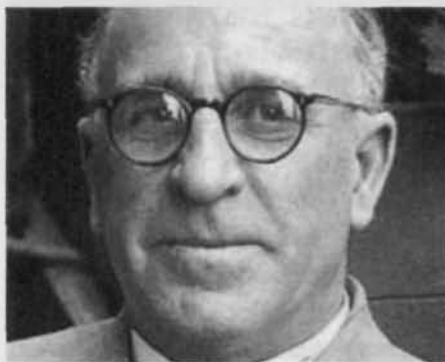
British agent Frank Foley

Meanwhile, in Britain the pressure was on to keep refugees out, as desperate queues increased on the Continent. In January 1938 the Director of Passport