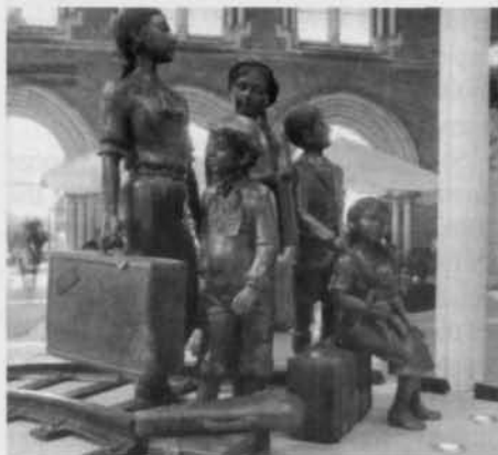
'Children of the Kindertransport'