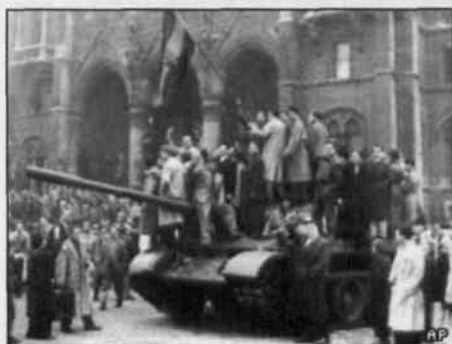
Hungarian freedom fighters force back Soviet tanks and troops

By 1956, discontent in Hungary had been fuelled by the failures of its Soviet-style economy, by the excesses of Rákosi's Stalinist regime, and by the wave of liberalisation that followed Nikita Khrushchev's denunciation of