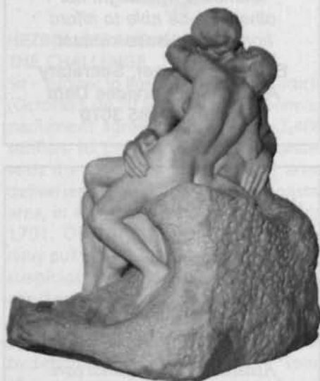
The Kiss , 1900–4, by Auguste Rodin. Pentelic marble, executed by Ganier, Rigaud and Mathet. 182.2 x 121.9 x 153 cm. Tate, London, NO6228. Purchased with assistance from the National Art Collections Fund.

Rodin's sensuality as a sculptor is self-evident, but for all the romance of his famous Kiss , in which the embracing lovers emerge seamlessly from the rough stone plinth, the sculptor also demonstrates a darker, more introspective talent. Balzac , John the Baptist and the Burghers of Calais reflect the emotional depth which indicates how his monumental public works not only broke with tradition, but introduced a more naturalistic humanity.