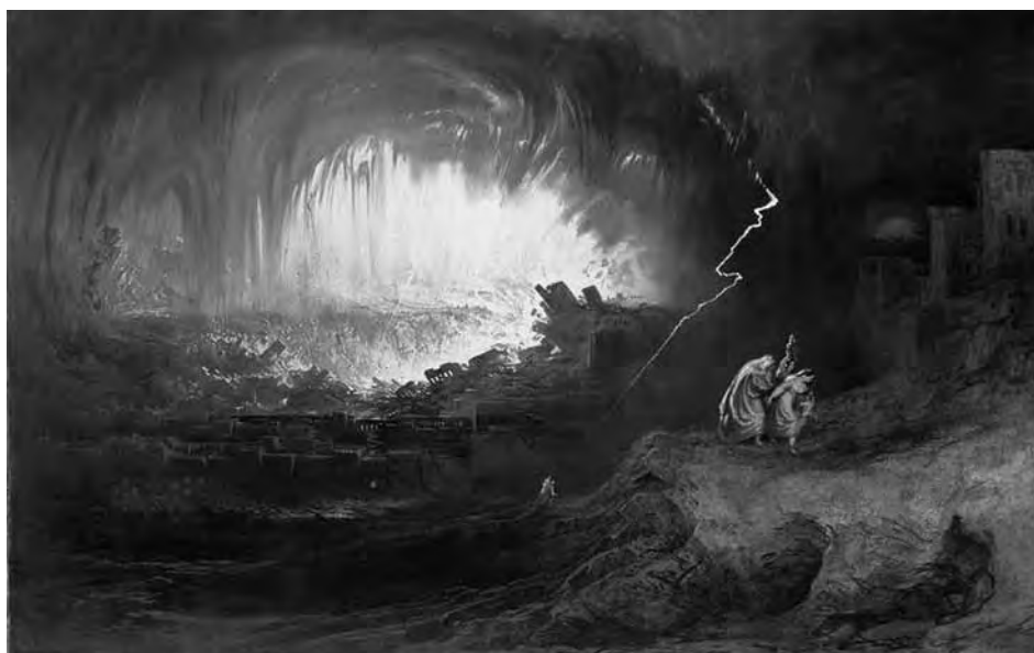
John Martin The Destruction of Sodom and Gomorrah (1852)

He may seem inspired by young dancers en pointe , but the work of Edgar Degas is closely attuned to photography and movement. The very title of the Royal Academy's latest exhibition, Degas and the Ballet: Picturing Movement (until 11 December), gives the game away. The scientific influences of the new explorative photographers Etienne-Jules Marey and Eadweard Muybridge are evident in the movement of his dancers at the barre and in repose, in sketches