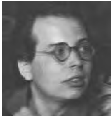
Hans Litten, 1903-38