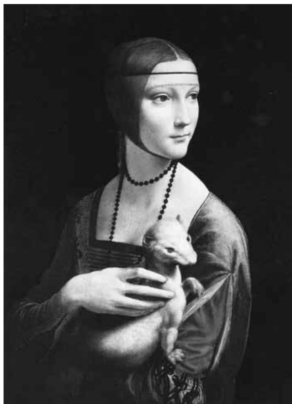
Cecilia Gallerani – 'The Lady with an Ermine'

Nine paintings appear in the National Gallery's much lauded landmark exhibition Leonardo da Vinci: Painter at the Court of Milan (until 5 February