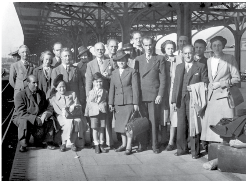
First group of Czech refugees arrives in Clacton-on-Sea, 1939

In 1939 the Jewish population of Czechoslovakia was 360,000, all of whom considered themselves Czech first and Jewish second. I am one of the last few survivors of a huge family which can trace its roots, mostly in the Bohumin and Ostrava area, back to around the