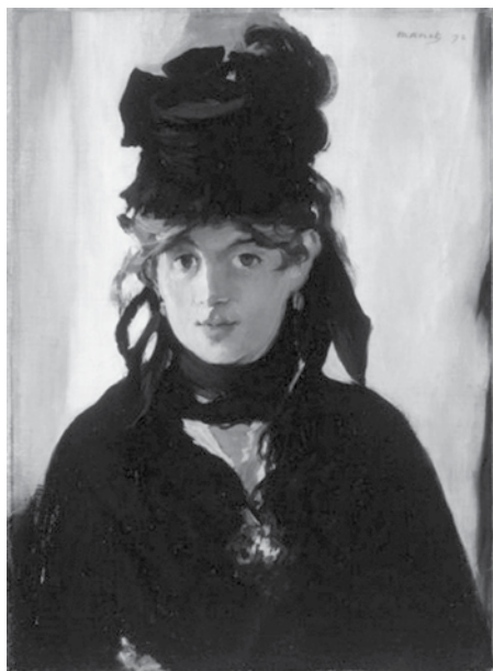
Edouard Manet Berthe Morisot with a Bouquet of Violets (1872), Musée d'Orsay, Paris

His Realism taught him the formalism of dark colours, when painting subjects like Antonin Proust or the two faces of Berthe Morisot, first in the charm of youth and later in the widowhood which ravaged