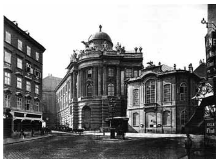
The Burgtheater on Vienna's Ringstrasse, built 1888

The acculturation of Vienna's Jews was among the fastest and most thoroughgoing in Europe; Viennese Jewry had the highest rate of conversion of any European city. However, Jews did not assimilate entirely into Viennese society, to the extent of losing their separate identity and being seen as indistinguishable from other Austrians. They tended to go to the same schools, to cluster together at the University of Vienna (where they were