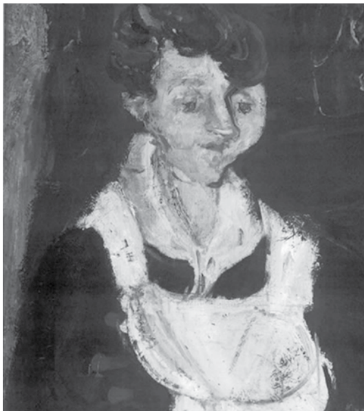
Chaim Soutine La Soubrette Oil on Canvas, 46.7 x 41 cm 1928-33

Two years ago the Ben Uri acquired Marc Chagall's Apocalypse en Lilas , the artist's powerful response to the Holocaust, in which the crucified Christ in a tallit is shown with a Nazi at the base of the cross, an upside-down clock and two flying figures holding a Sefer Torah . The Museum's latest acquisition, Chaim Soutine's La Soubrette (The Waiting Maid, c. 1933), suggests something apparently calmer, yet with an equally disturbing message – about time and place in society.