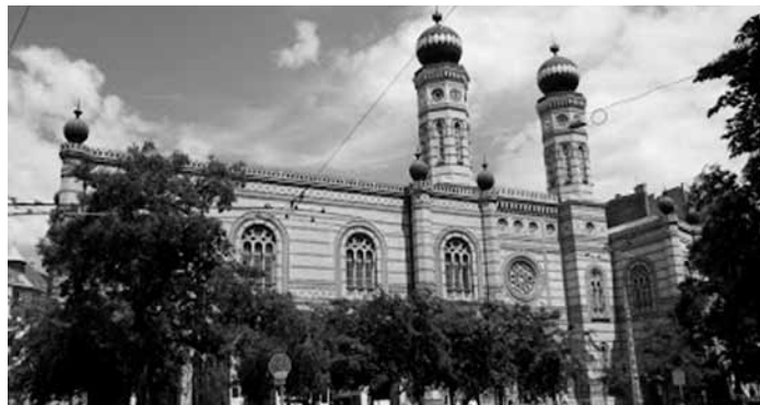
The Dohány Synagogue in Budapest

was Martin Buber, born in Vienna in 1878 but raised from the age of three by his grandfather in Lemberg. The second largest city in eastern Galicia was Brody, a major commercial centre that became known as 'Trieste on the continent', offering an opening to Russia