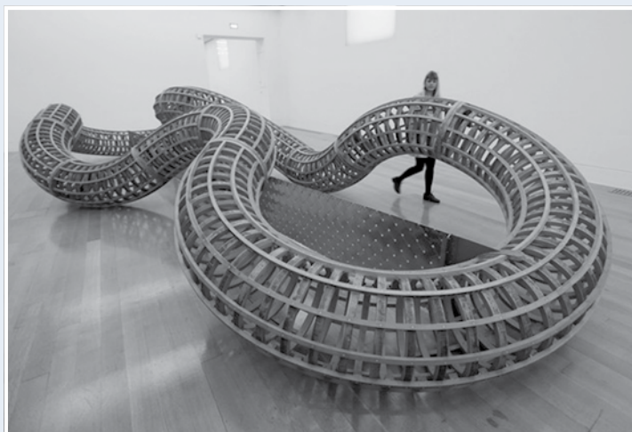
After (1998)

It is one thing to paint the same thing from different perspectives but what is unusual about these two van Gogh paintings