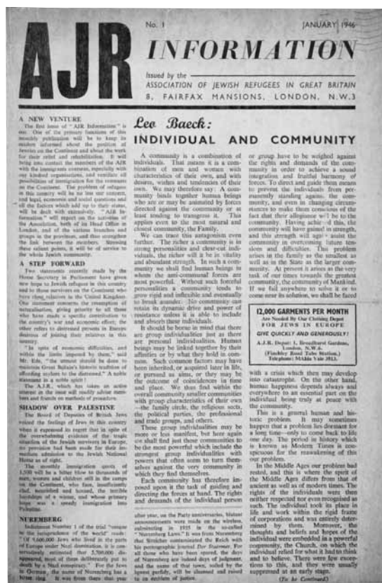
Cover page of first issue of AJR Information