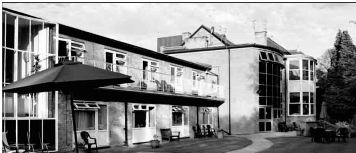
The Morris Feinmann Home, Manchester