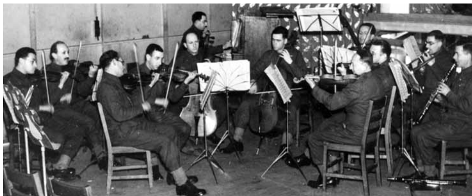
A group of musicians at Kitchener Camp established an orchestra and performed regular concerts for local residents in and around Sandwich on Saturday evenings (from In Pictures: Kent's Haven for German and Austrian Jews – BBC)