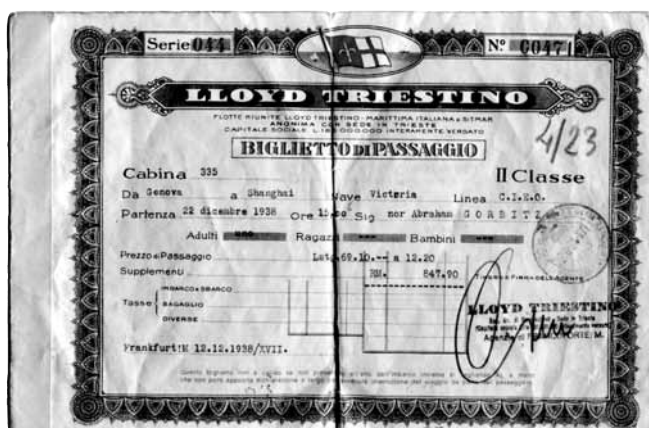
Ticket to Shanghai via the Victoria , 22 December 1938