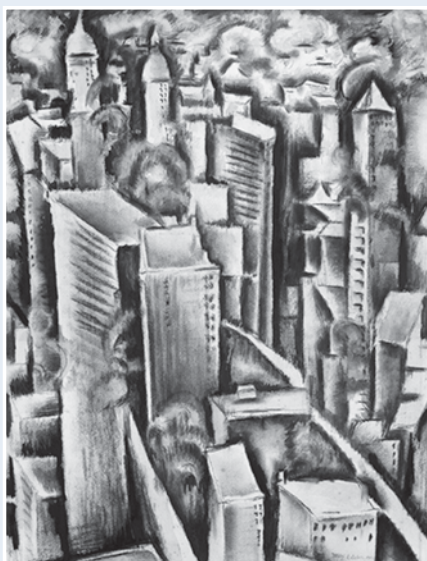
Max Weber New York (1912)

Selected for Hopper's first major exhibition in Texas in 1970, the images were rediscovered only after his death in 2010. Taken with a Nikon F camera with a 28mm lens, a gift from his future wife Brooke Hayward, some are raw, edgy and casual as though anyone could have snapped them. But together they represent a portfolio of lost times. As a young actor at the beginning of his