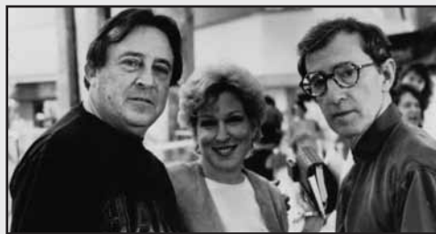
Paul Mazursky in 1991 when directing Woody Allen and Bette Midler in Scenes from a Mall

Having established himself as a 'bankable' director, Mazursky was able to preserve his creative independence during the following years especially by keeping his budgets low and balancing the occasional flops against the modest box-office success of most of the others.