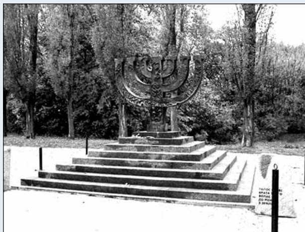
Babi Yar memorial, Kiev

by the Nazis themselves, perhaps the most notorious is that at Babi Yar, a ravine near the Ukrainian capital Kiev. It was there, on 29-30 September 1941, that 33,771 Jewish men, women and children were murdered by Einsatzgruppe C .