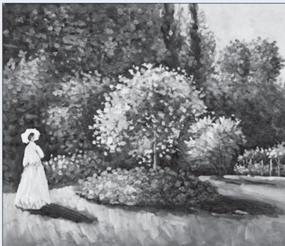
Claude Monet Jeanne-Marguerite Lecadre (Lady in a Garden) 1867

And yet it is Monet with whom we start and Monet with whom we end. The exhibition spans the early 1860s to the 1920s, a period which saw considerable social change and creative innovation. Despite the coming of war, romance flowered in the horticultural imagination of artists, often with darker imagery, as we begin to see in Monet, whose pacific and structural format, as in his 1867 Lady in a Garden – almost ethereal in her white sunhat and pale blue dress, contemplating a bed of red flowers beneath a small flowering tree – develops into something more abstract later. In earlier years, Monet would write copious letters to his gardener specifying what should be planted, a practical and formal side to his nature, indicating how the artist did not just paint what he saw and felt but had a hand in the gardens' original design.