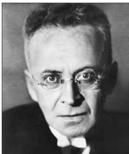
Karl Kraus, 1874-1936

particular to the weaknesses and deficiencies of Austrian liberalism. The liberals had suffered a stunning defeat through the failure of the revolution of 1848, which, they had hoped, would establish a democratic, constitutional form of government in the Habsburg Empire but was instead brutally suppressed by the