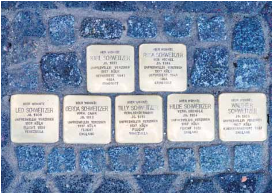
The Stolperstein stones for the Schweitzer family.