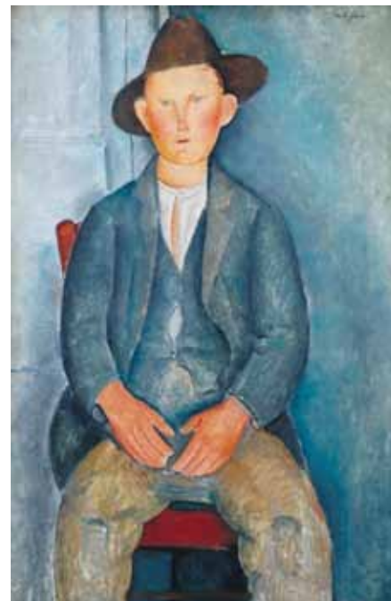
Amadeo Modigliani The Little Peasant c.1918

Tate's exhibition features the largest group of his nudes ever shown in the UK. Twelve are on show in an exhibition which also includes an immersive experience in which, with the aid of technology, you can be projected into the studio where he created his last work in 1919, a self-portrait, in which the robust Italian face has dwindled to a narrow image of one facing death. Modigliani's tragedy is also the tragedy of his last partner, Jeanne Hébuterne,