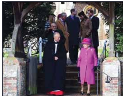
Step in the footsteps of the Royal Family at the parish church of St Mary Magdalene, Sandringham

The group will be based in Norwich, which has a fascinating Jewish history dating back to