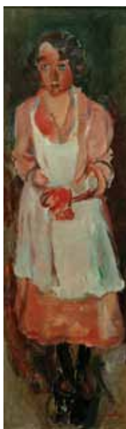
The Chambermaid by Soutine

which reflect the nervous demeanour or anxiety in their faces. The butcher's boy's overalls are soaked in blood; as an Expressionist metaphor it is direct and visceral. While one bellboy, spread-eagled in his crimson uniform, has a sneering, insouciant look, another similarly dressed, has much less bravado. He stands awkwardly, poignantly waiting, as waiters do, not offering but begging. Many share the same pointy face and large ears – suggesting the poignancy of raw emotion stretched into a visceral unhappiness in a life of service.