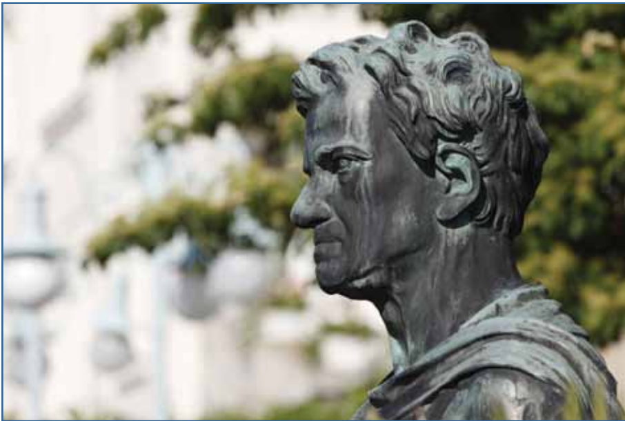
Monument to Franz Grillparzer at Volksgarten in Vienna