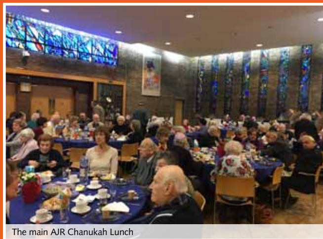
The main AJR Chanukah Lunch