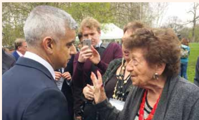
Mayor of London Sadiq Khan talks with AJR member Judy Benton at the national commemoration event on 15 April