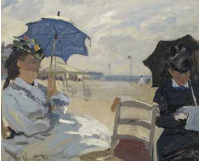
Claude Monet, The Beach at Trouville , 1870