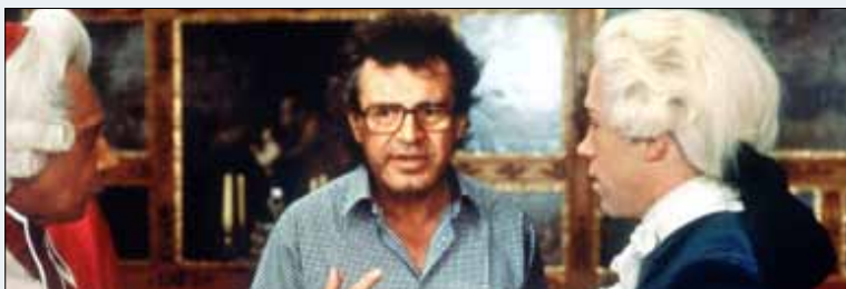
Miloš Forman on the Amadeus film set