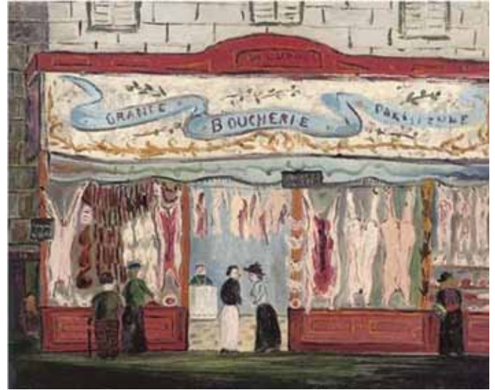
La Grande Boucherie , Fred Uhlman

Perhaps the title Monet & Architecture at the National Gallery is misleading because the artist's impressions of London Bridge, Le Havre, the bridge at Argenteuil, the Palazzo Dario in Venice and the ancient Rouen Cathedral, are his pure vision of light on water, the blend of soft ochre sunsets and blue skies, and the submerging of everything – streets and people – into a near mystical snowscape.