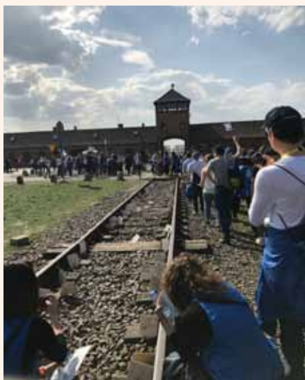
Arriving at Birkenau