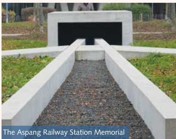
The Aspang Railway Station Memorial