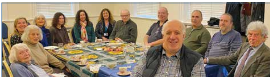
AJR members in Sussex recently enjoyed their first meeting at Ralli Hall in Hove

Sign up here: https://www.eventbrite.com/e/online-launch-of-the-hyphen-tickets-483711573337 or for more information email debra@ajr.org.uk