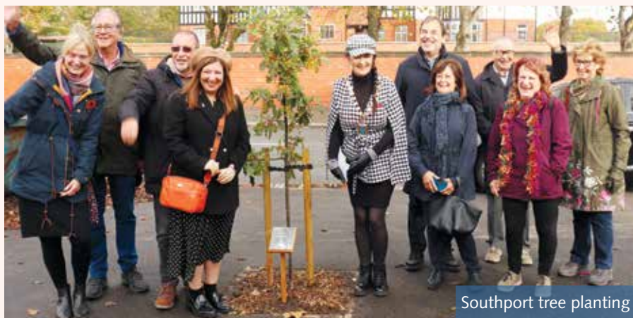
Southport tree planting

While they were at 'Harris House' the girls were taught English, elocution, needlework, modern Hebrew and Jewish religious education. They all spoke highly of the welcome they were shown by the local Southport