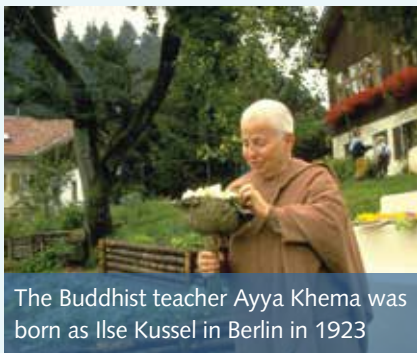
The Buddhist teacher Ayya Khema was born as Ilse Kussel in Berlin in 1923