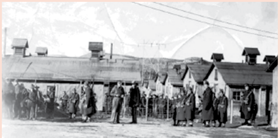
Guards and prisoners at Red Rock internment camp in Ontario

It was a very unhappy voyage to Canada as almost immediately tensions arose between the Nazi POWs and the supposed Enemy Aliens, the majority of whom were Jewish, anti-Nazi or victims of Nazi oppression. One unfortunate