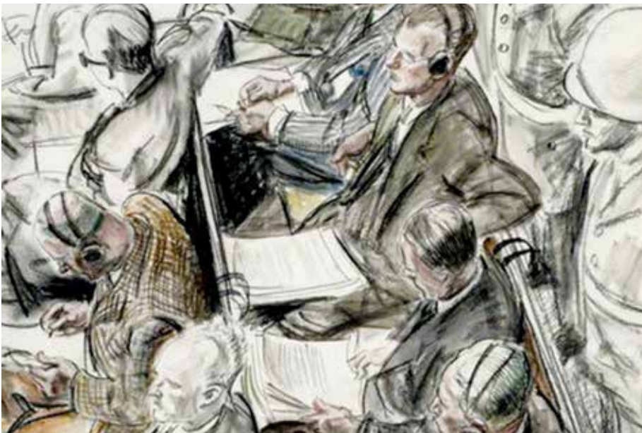
Dame Laura Knight, Prisoners in the Dock at Nuremberg Trials, No. 2

At the end of July a new exhibition opened at the Ben Uri Museum in St. John's Wood. The exhibition, called A Brush with Evil: The Nuremberg Trials, 1946 featured two powerful works by Dame Laura Knight (1877-1970).