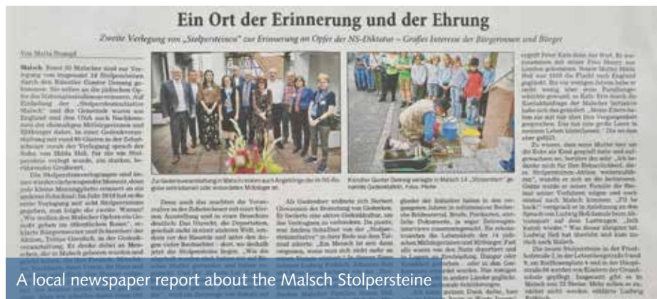
A local newspaper report about the Malsch Stolpersteine