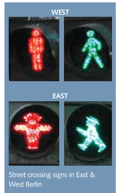
Street crossing signs in East & West Berlin

Equally poignant was lying on the grass listening to a klezmer concert in the beautiful gardens of the Jewish Museum on a warm sunny Sunday afternoon with 200 others; I couldn't help but wonder what Hitler would have made of that!