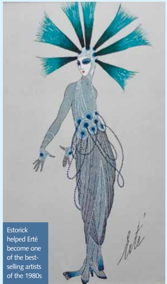
Estorick helped Erté become one of the best-selling artists of the 1980s

In 1967 he met the Russian-born French designer Erté (Romain de Tirtoff), whose art deco work had been popular in the