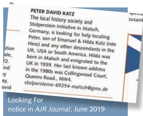
Looking For notice in AJR Journal , June 2019

I now feel that a part of this void in my life has been filled and, at long