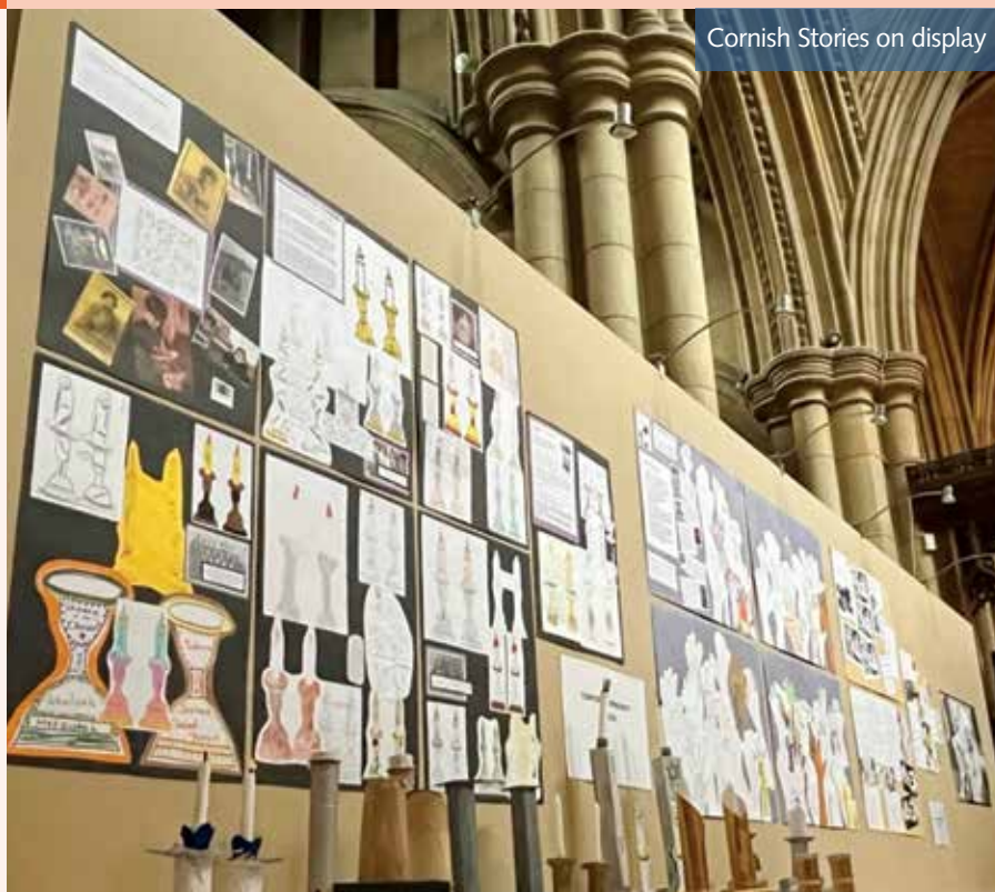
Cornish Stories on display