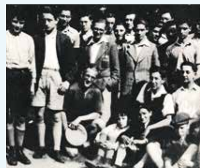
Boys at the Leeds hostel