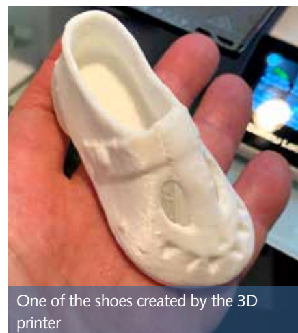
One of the shoes created by the 3D printer