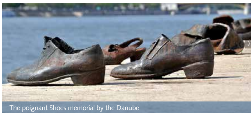
The poignant Shoes memorial by the Danube