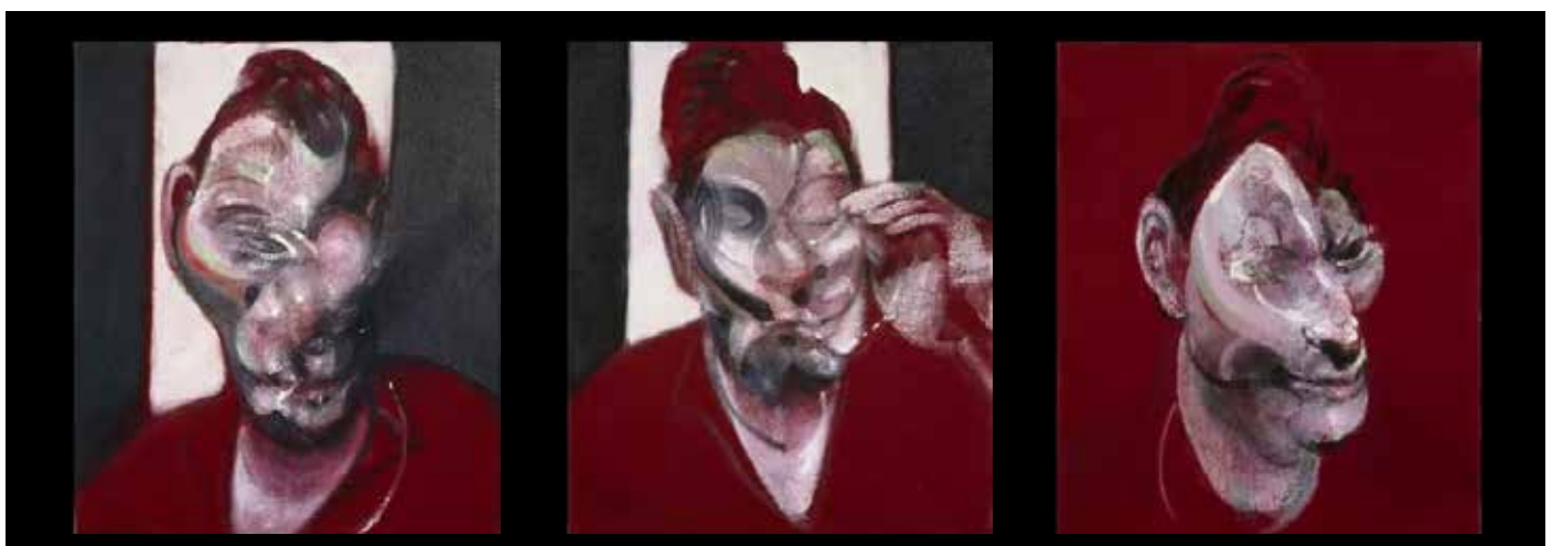
The National Portrait Gallery is fronting its Frances Bacon exhibition with these three images

Human Presence at the National Portrait Gallery runs until 19 January 2025.