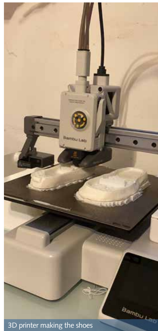
3D printer making the shoes